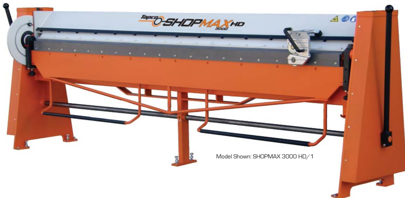
Model Shown: SHOPMAX 3000 HD/1