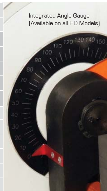
Integrated Angle Gauge (Available on all HD Models)

for more information, please visit www.tapcoeurope.com